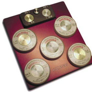
Reference block with 5 standards

The Hocking branded range of Operating Reference Blocks are derived, certified and traceable to national standards (NIST, USA and NPL, UK), conductivity references ideal for laboratory and field use. Up to five blocks can be clipped into a sample holder plate to bring them quickly into thermal equilibrium with each other and the test piece when the plate is placed upon it. The instrument can then be set for optimum accuracy using the dual setting block (PRN 47A023). All operating reference blocks are rigorously tested to meet high standards of accuracy and reliability. The blocks are calibrated to be accurate to \pm 1.2\% of the value or \pm 0.4\% IACS, whichever is less.